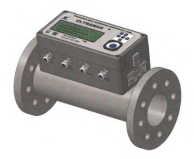
Figure 1 – ULTRAMAG general drawing

The systems have 3 options of design based on measurement accuracy of the operating flow rate and the following modifications based on the upper range limit of the operating flow rate measurement: G10, G16, G25, G40, G65, G100, G 160, G250.